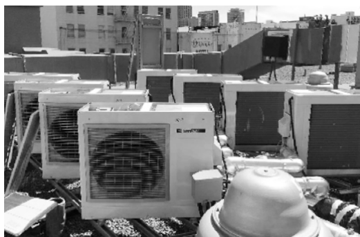
Rooftop air to water heat pumps.